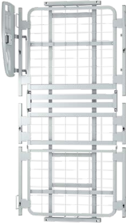
Bed frame, overhead view

Convenient decals indicate proper placement of each extender.